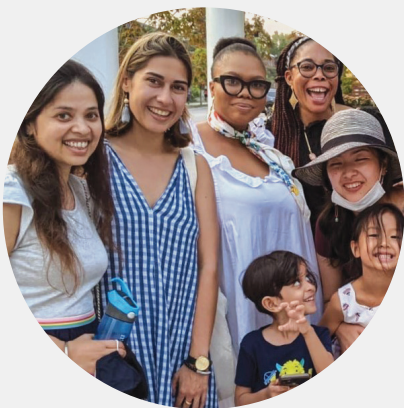
Toronto Centre of Learning & Development

The work is not easy, we must be bold. Poverty does not happen overnight, and solutions will not either. But with support from Leadership donors like you, we can address the challenges of today while building a better tomorrow for everyone.